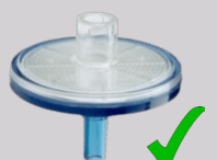
Non vented filters